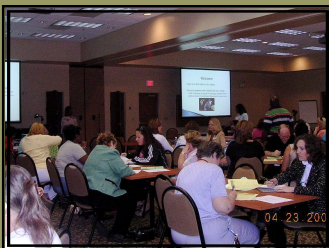
Seven orientations were held during April in Polk and Osceola.